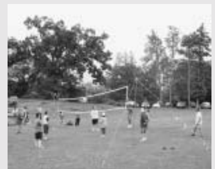
Volleyball was one of many fun activities that took place at the picnic at Forsythe Park.