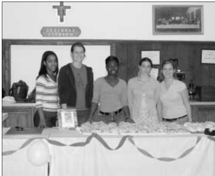
Thanks to SUNY New Paltz Chapter of AmeriCorps for volunteering at the dance.

chapter of AmeriCorps. Together they ensured the event's success. AmeriCorps is a network of local, state, and national service programs that connects more than 70,000 Americans each year in intensive service to meet our country's critical needs in education, public safety, health, and the environment. The smiles that we saw through-