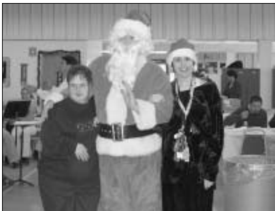
Santa posed for pictures with the consumers in New Paltz. They were able to take the pictures home to show their friends and family.