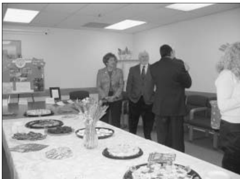
Gateway donors gathered at a lovely reception in the Cornelske Center conference room. Artwork from the Art Therapy program was on display. The Art Therapy program would not have been possible without a large donation from the Ulster Savings Bank Charitable Foundation.

Special recognition was given to The Ulster Savings Bank Charitable Foundation as the first inductee to the newly created category of “Lifetime Benefactor”. The Foundation awarded GCI a grant of $10,000 to fund an art therapy program at the Chestnut Center. Several examples of artwork from this program were on display during the reception.